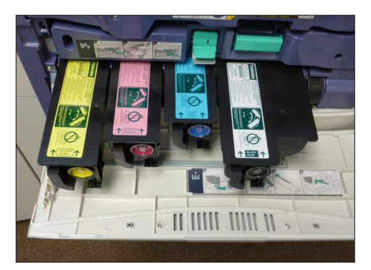
Toner replacement is easy and can be done on-the-fly. Instructions on toner replacement are provided onscreen and on the inside of the cover of the device.