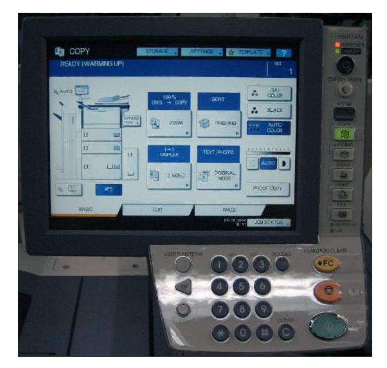
The e-STUDI06570C's Control Panel

+ The e-STUDIO6570C's color touchscreen control panel is logically organized and features hard keys to access the main functions and touchscreen selections for each menu. The display was bright at default settings, but is also adjustable via the user functions hard key. A question mark icon provides dynamic help related to the menu or sub-menu a user is currently in.