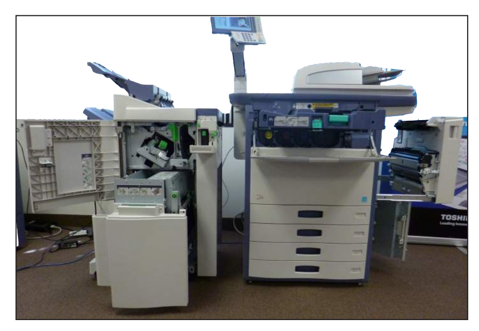
Clearing a misfeed from the finisher area