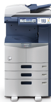
e-STUDIO306 with 2,000-Sheet LCF.