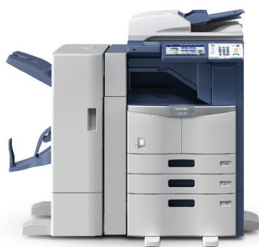
e-STUDIO306 with 2,000-Sheet LCF, Hole Punch, and Saddle-Stitch Finisher.