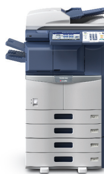
e-STUDIO306 with 50-Sheet Inner Finisher and Hole Punch.