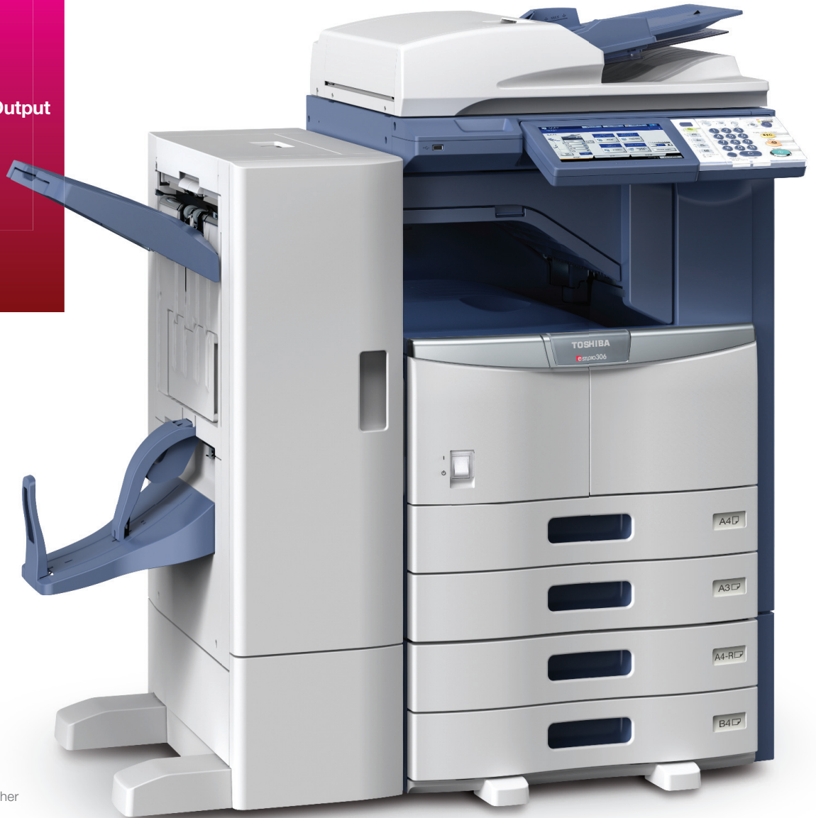
e-STUDIO306 with Saddle-Stitch Finisher