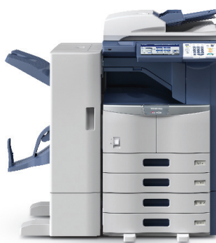
e-STUDIO306 with Saddle-Stitch Finisher.