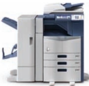
e-STUDIO306 with 2,000-Sheet LCF, Hole Punch, and Saddle-Stitch Finisher.