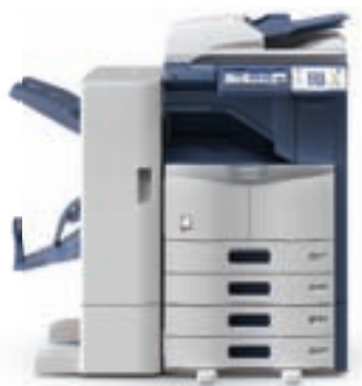
e-STUDIO306 with Saddle-Stitch Finisher.