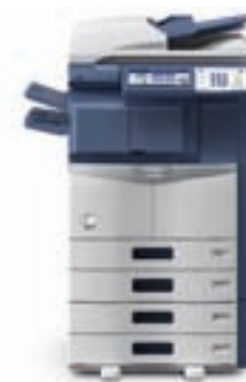
e-STUDIO306 with 50-Sheet Inner Finisher and Hole Punch.