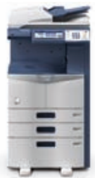
e-STUDIO306 with 2,000-Sheet LCF.