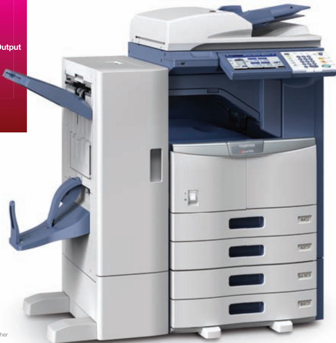
e-STUDIO306 with Saddle-Stitch Finisher