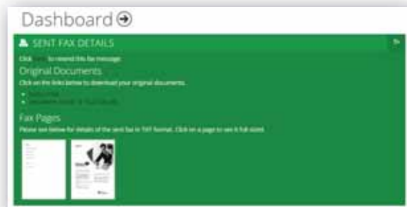
Sophisticated online dashboard

For large businesses with multiple sites, it is a cost effective way to consolidate and simplify the management of fax in your business.