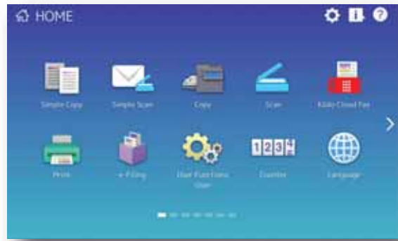
Multi-function device work ow panel

You may be able to port or transfer your existing fax number service to Kōdo Cloud Fax, allowing you to receive faxes to email. By porting an existing fax number you will save on fax line rental and associated fax receiving costs, and importantly never miss a fax again!