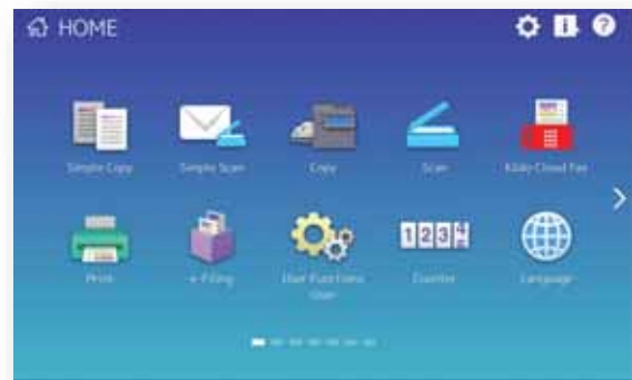
Multi-function device work ow panel

You may be able to port or transfer your existing fax number service to Kōdo Cloud Fax, allowing you to receive faxes to email. By porting an existing fax number you will save on fax line rental and associated fax receiving costs, and importantly never miss a fax again!