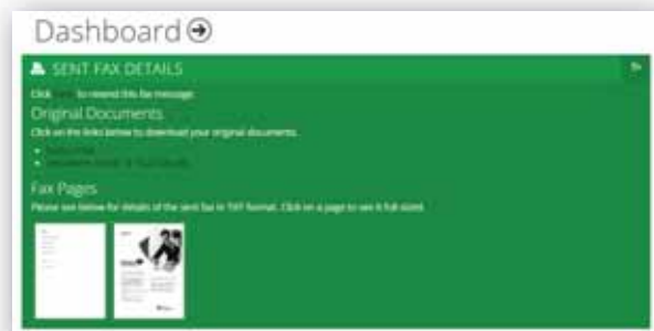
Sophisticated online dashboard

For large businesses with multiple sites, it is a cost effective way to consolidate and simplify the management of fax in your business.