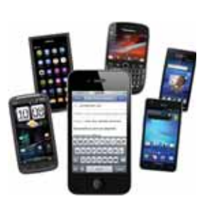
Email Print Let students send documents to print as attachments via email, from anywhere, including from their mobile devices.